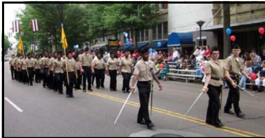
Howard High School JROTC salute as they pass in review during Chattanooga's Armed Forces Day Parade.