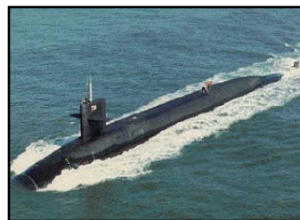
USS TENNESSEE (SSBN 734)

ticular ship (Our Council has adopted the USS Tennessee (SSBN 734), squadron or station; family-centered gatherings, and direct material and/or financial support.