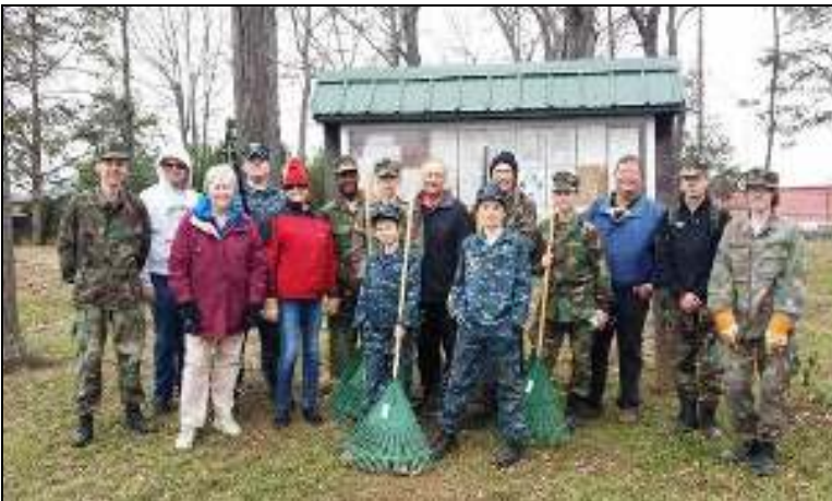
Cadets with DAR & SAR members at the Brainerd clean-up.

Cemetery to assist the Daughters & Sons of the American Revolution clean up the cemetery in preparation for Flag Day. Everyone raked leaves and picked up many broken and fallen limbs until inclement weather drove them off. It's not known if any cadets went home and applied their newly perfected leaf raking skills around home! A special thanks to Krispy Kreme on Brainerd Road as they provided free hot chocolate and thanks for giving back to the community.